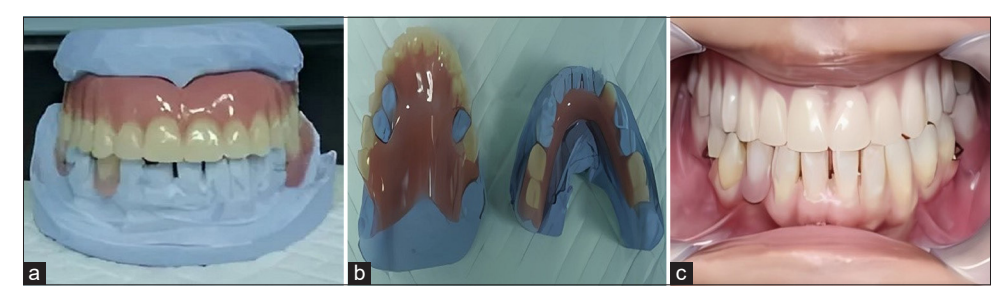
Figure 5: Provisional removable partial dentures, copied from the wax-up. (a) Frontal extra-oral view. (b) Occlusal extra-oral view. (c) Frontal intra-oral view.