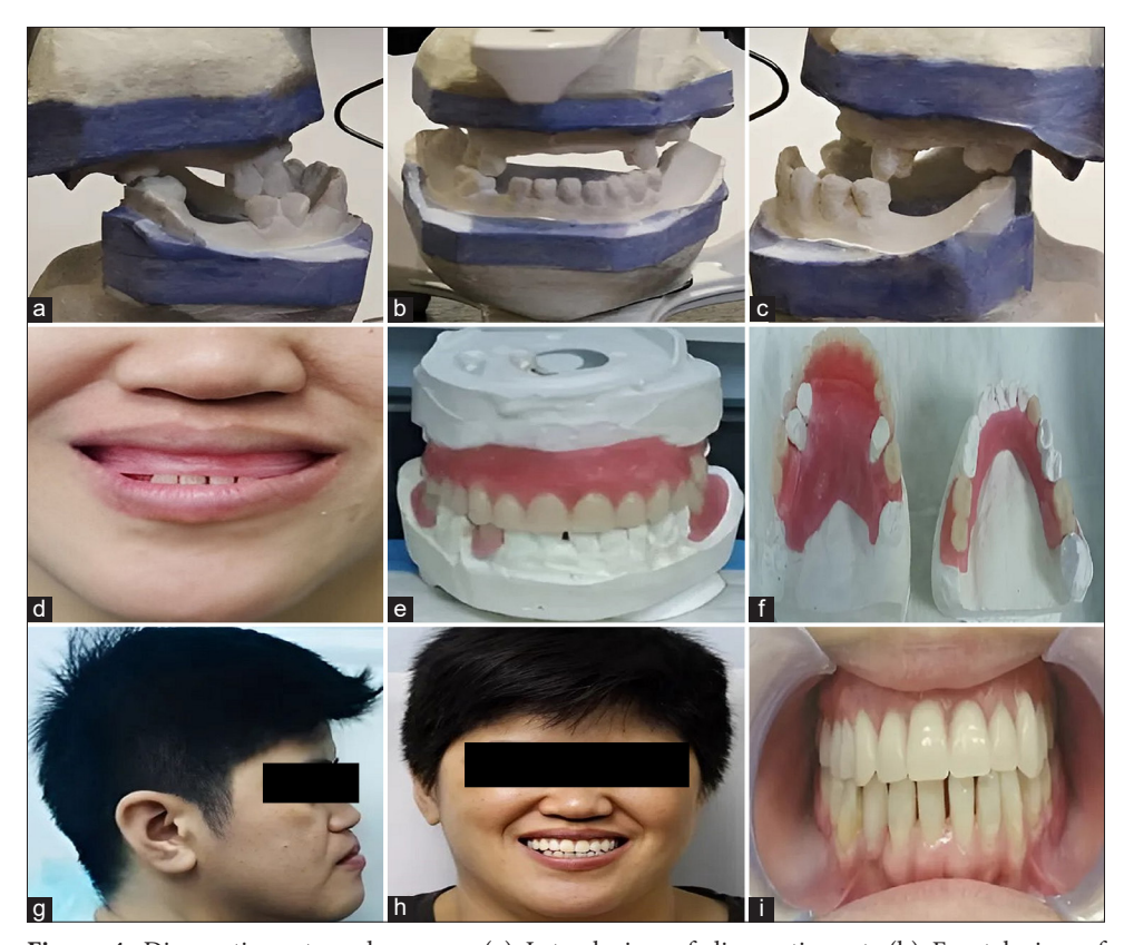
Figure 4: Diagnostic casts and wax-up. (a) Lateral view of diagnostic cast. (b) Frontal view of diagnostic cast. (c) Left lateral view of diagnostic cast. (d) Frontal view showing the maxillary labial flange of the wax up before teeth setup. (e) Frontal view of the wax up. (f) Occlusal view of the wax up showing the planned upper maxillary overlay denture design which camouflages the upper canine and premolars within the overlay denture framework for best esthetics and retention. (g) Patient showing class-1 profile with the wax up noting the improvement after increasing the thickness of the upper labial flange to 10 mm. (h) Improvement in smile esthetics with the designed wax-up. (i) Intraoral view of the wax-up showing class-1 incisor relationship.

with marked resorption of maxillary ridge anteriorly and mandibular ridges posteriorly [Figure 3]. Diagnostic casts were fabricated for further occlusal examination [Figure 4]. The Kennedy classification for the upper arch was class-3 modification-2 and for lower arch was class-2-modification-2. On the basis of the combined above clinical and radiographic examinations, the diagnosis was skeletal class-3 malocclusion, with negative overjet of 8 mm, with partially edentulous upper and lower ridge. She was presented in detail with all alternative treatment options for the replacement of her missing teeth. However, she wanted new RPDs. Therefore, the treatment objective was to construct a definitive cast RPDs that would establish a class-1 jaw relationship and hence provide her with improved esthetics, occlusion, mastication, and speech. The treatment plan included the construction of provisional acrylic (RPD) for initial assessment, followed by the definitive cast (RPD) over 7 month's period. The treatment plan started with scaling and polishing of her teeth and she was educated on the prevention of caries and periodontal