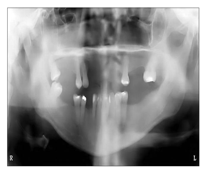
Figure 3: Pre-treatment radiograph. Orthopantomogram showing 17 missing teeth and resorbed upper and lower edentulous ridges. 27 Over-erupted.

with marked resorption of maxillary ridge anteriorly and mandibular ridges posteriorly [Figure 3]. Diagnostic casts were fabricated for further occlusal examination [Figure 4]. The Kennedy classification for the upper arch was class-3 modification-2 and for lower arch was class-2-modification-2. On the basis of the combined above clinical and radiographic examinations, the diagnosis was skeletal class-3 malocclusion, with negative overjet of 8 mm, with partially edentulous upper and lower ridge. She was presented in detail with all alternative treatment options for the replacement of her missing teeth. However, she wanted new RPDs. Therefore, the treatment objective was to construct a definitive cast RPDs that would establish a class-1 jaw relationship and hence provide her with improved esthetics, occlusion, mastication, and speech. The treatment plan included the construction of provisional acrylic (RPD) for initial assessment, followed by the definitive cast (RPD) over 7 month's period. The treatment plan started with scaling and polishing of her teeth and she was educated on the prevention of caries and periodontal