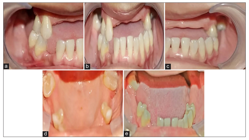
Figure 2: Intra-oral views, showing anterior cross-bite and reverse overjet. (a) Right lateral view. (b) Frontal view. (c) Left lateral view. (d) Upper occlusal view. (e) Lower occlusal view.