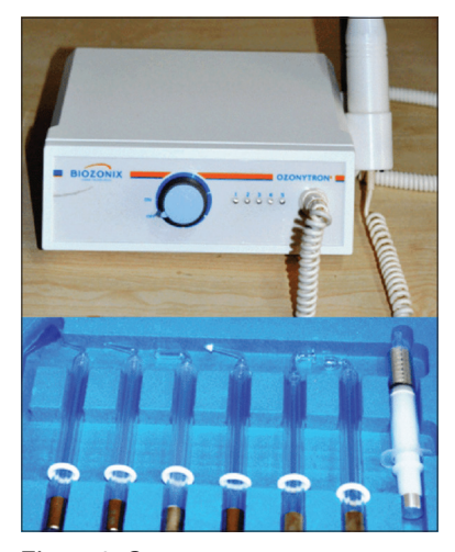
Figure 2: Ozone generator